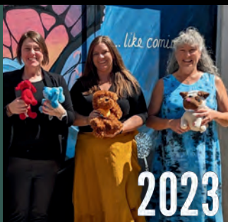
Animal kennels for residents in shelter