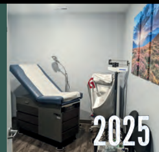
Community-based Adult Medical Forensics coming soon