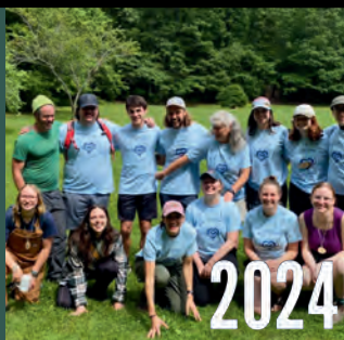
Camp Hope America and Pathways starts in Henderson County