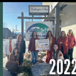
2022 Washington Street office opens