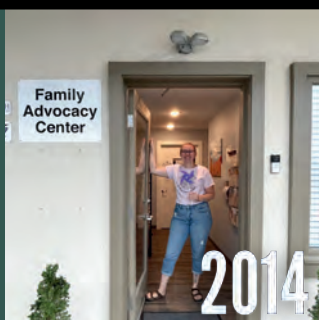
2014 Family Advocacy Center opened