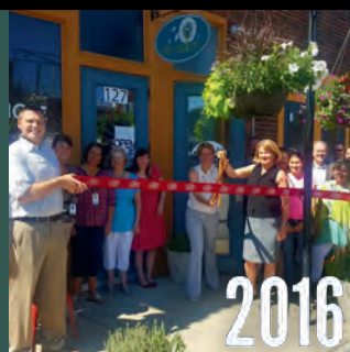
2016 Merger of Mainstay and The Healing Place creates Safelight, Inc.